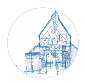
Blue Hub Home for Facilitation & Convening