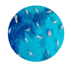
Blue Ventures Supporting Entrepreneurship and Capital Investment